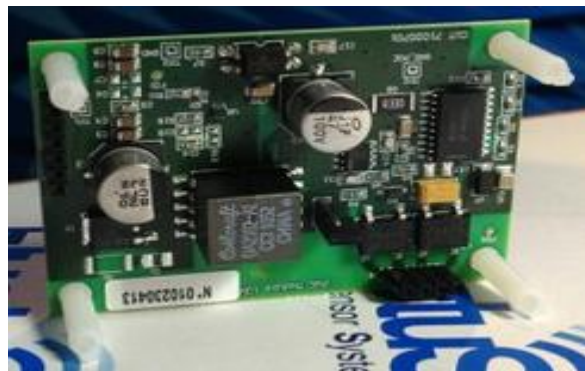
Figure 3 – PoE Module

FluctuS addresses a professional target: system integrators, design consultants in the IoT and Smart Cities sector. It wants to be a virtual place where the